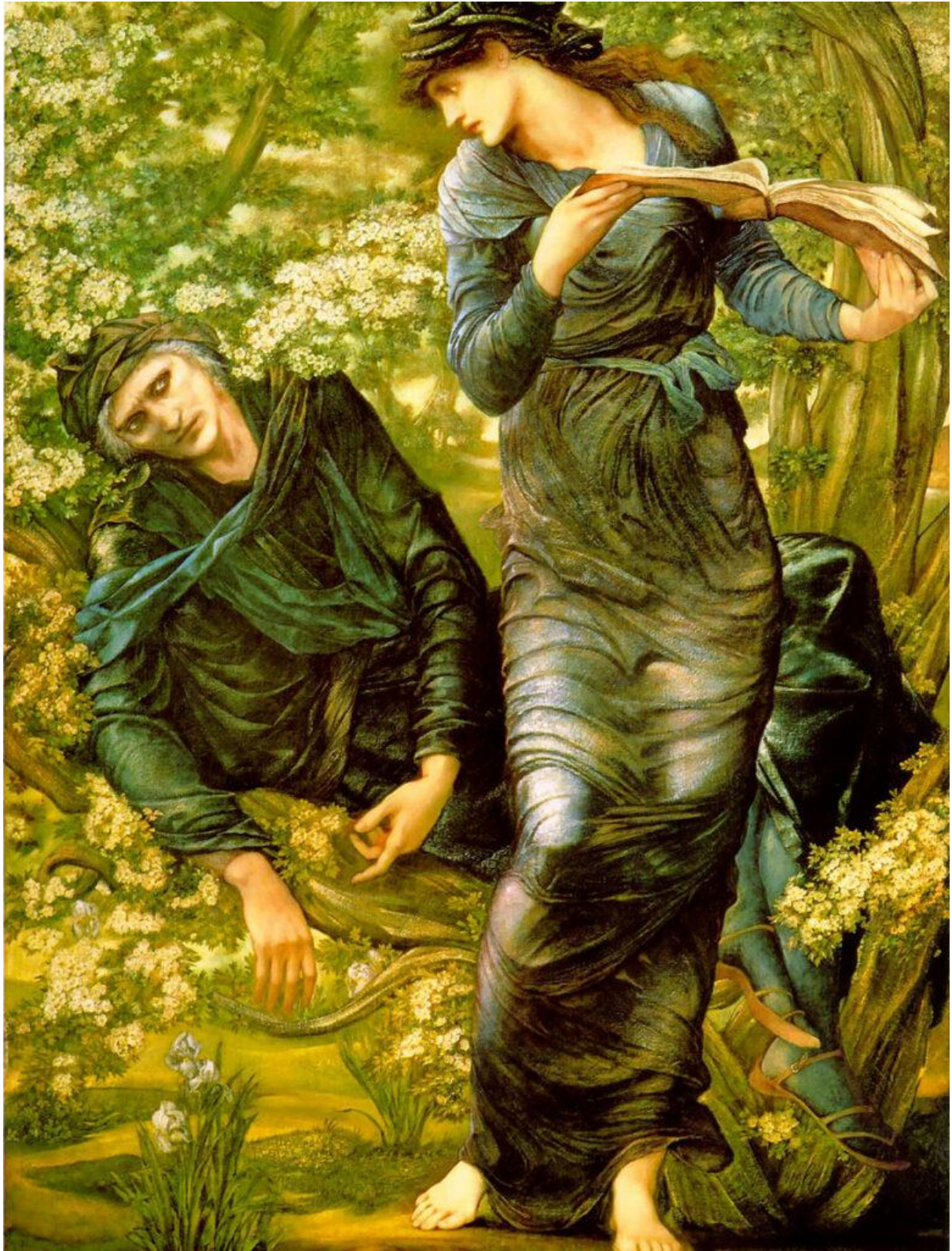
Maria Zambaco as Nimue in The Beguiling of Merlin , Sir Edward Burne-Jones Maria was highly spirited and flouted convention quite boldly. Having inherited a fortune from her father when she was merely fifteen, she could afford to care less about what polite society felt about her. She refused to have a chaperone in her adolescence, she divorced her first husband, and pursued a career in the arts that was completely fueled by her abundant passion.