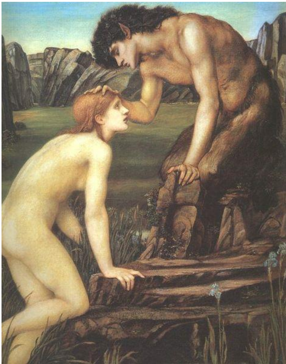
Pan and Psyche,

In Greek mythology, when Psyche is distraught over the loss of her love Eros, she attempts suicide in a river. She survives and the god Pan offers her comfort and advice.