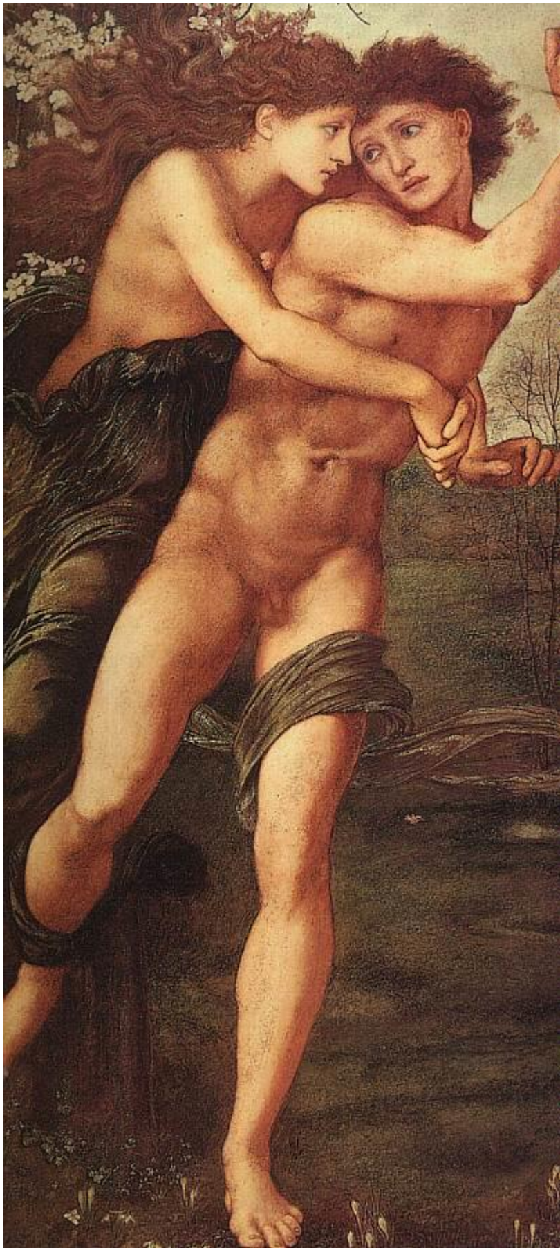
Phyllis and Demophoon,